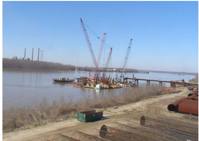
A study in contrasts... Above is from January 31, 2008. Below is the same exact location on April 30, 2008.

The water level of the Mississippi River is being monitored daily for changes. When it again reaches a safe level, work on the trestles will resume. Once the trestles are complete, work crews will be able to continue work on the main bridge structure despite future river conditions.