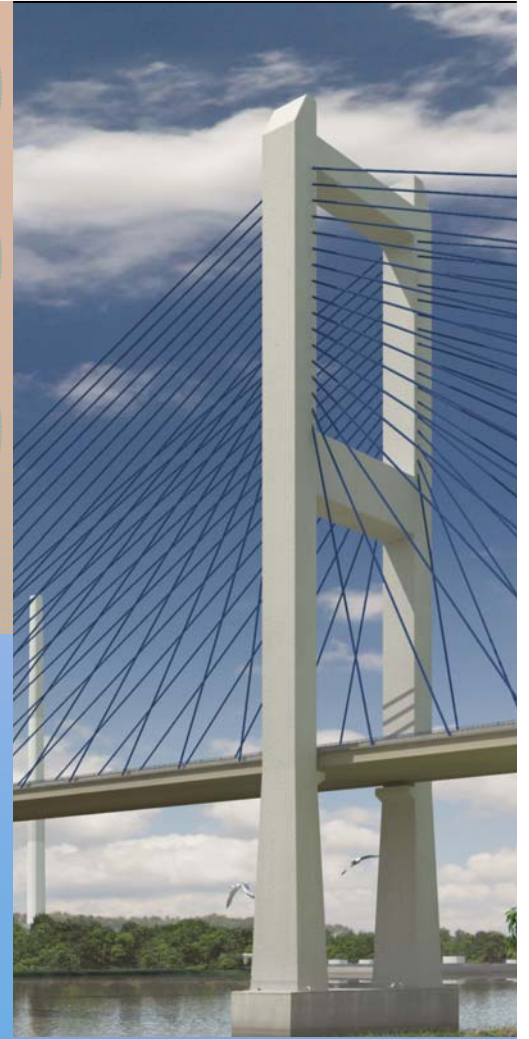
The John James Audubon Bridge Center of the Parkway